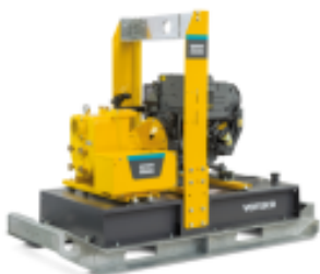
SKID02 VAR 4-250