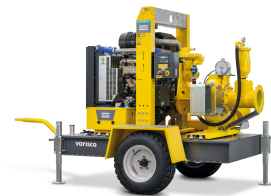
PAC H43C TRAILER