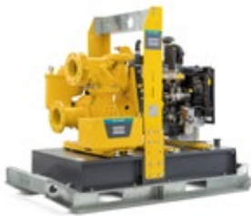
PAC H43C SKID02